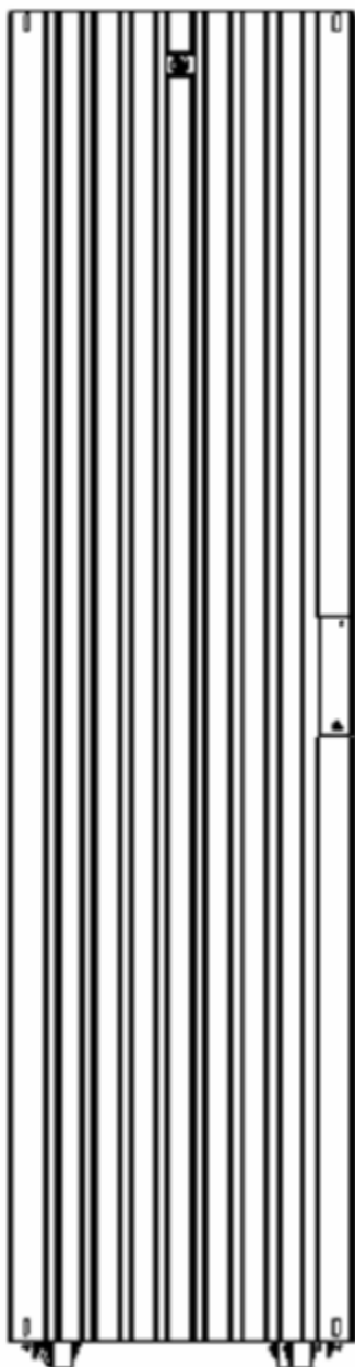
HP Rack 10000 G2 Series - front view

In addition to the universality of the new racks, important improvements have been made from the previous version, including improved and updated front door design with bright-aluminum finish; improved front and rear door handles and latches, and easier to handle three section side panels.