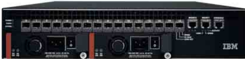
Sixteen dual-mode Fibre Channel and Gigabit Ethernet ports in 2U height